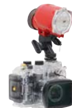
Canon PowerShot G15

※1 When using a Mount Base, wireless connection is not usable. Connect a strobe and housing with an INON Optical D Cable product. ※2 Depending on shooting situation, S-TTL Auto mode could be less accurate.