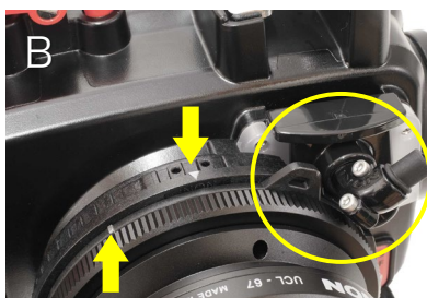
Incomplete lock due to interference with a cable.