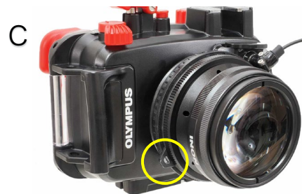
Proper strap eyelet position when locked