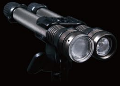
Double Light Holder • LE & Z Joint