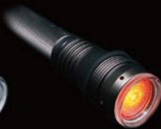
with the Red Filter・LE