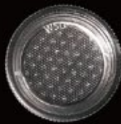
W50° Filter・LE Optional product