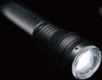
with the W40° Filter・LE