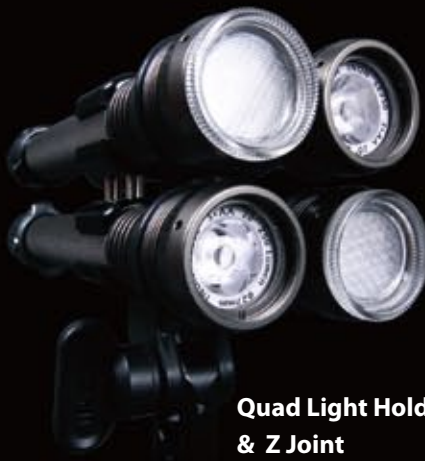
Quad Light Holder • LE & Z Joint