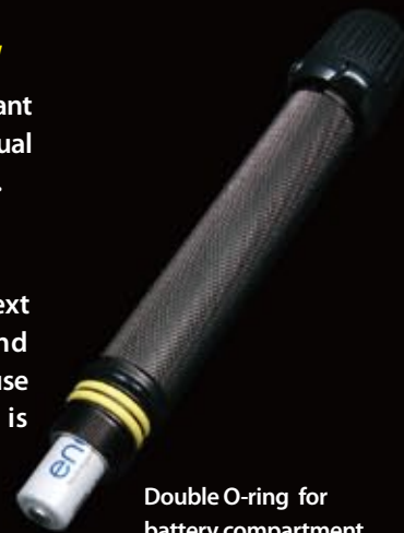
Double O-ring for battery compartment

(※)Depth rating 120m. INON has confirmed operation check at 78m depth during use test.