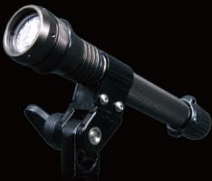
Single Light Holder • LE