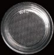
W40° Filter・LE Comes with the LE250